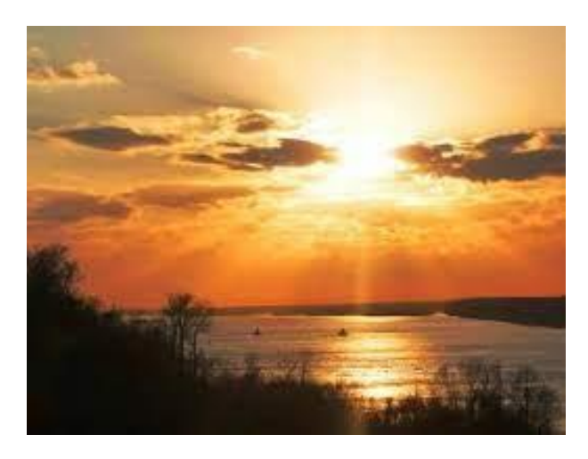
I will give you as a light to the nations – Isaiah 49 v6