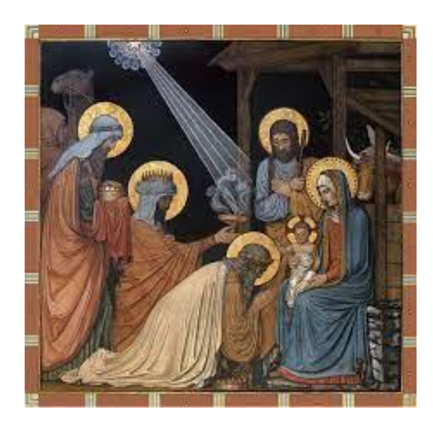
Epiphany 8th January 2023