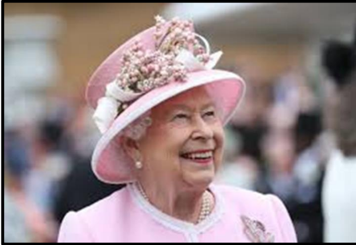
Queen Elizabeth II 1926-2022

Welcome to our Service of Holy Communion